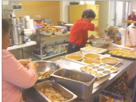
Food Preparation in Matthew 25 Kitchen

They asked The Matthew 25 Center to partner with them in this endeavor by providing the use of the Center as a base of activities to prepare the food and to gather and sort the toys that were donated for the children. The Center was a beehive of activity the week before the events! Some nights volunteers worked until 2:00 a.m.!