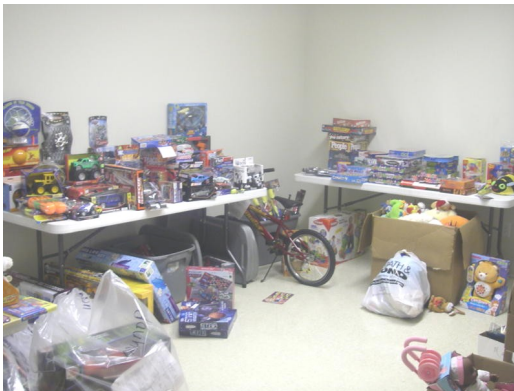
Toys to Be Given to Inmate Children

A total of 129 children from 65 inmate families participated in the event. Each child received a Christmas gift which was provided by Families in Crisis. In addition, the families enjoyed a great Christmas dinner, but the greatest gift of all was getting to spend quality time together as a family. Plans are already under way to repeat the event next year. Plan now to be a part of this effort!