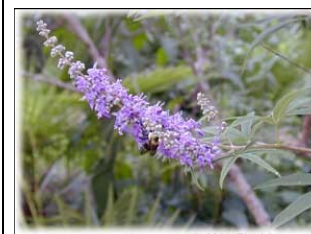
Chaste Tree Blossom